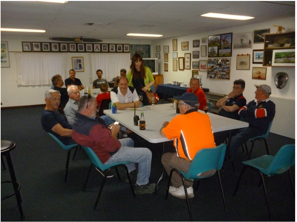
WALAC Pilots Briefing