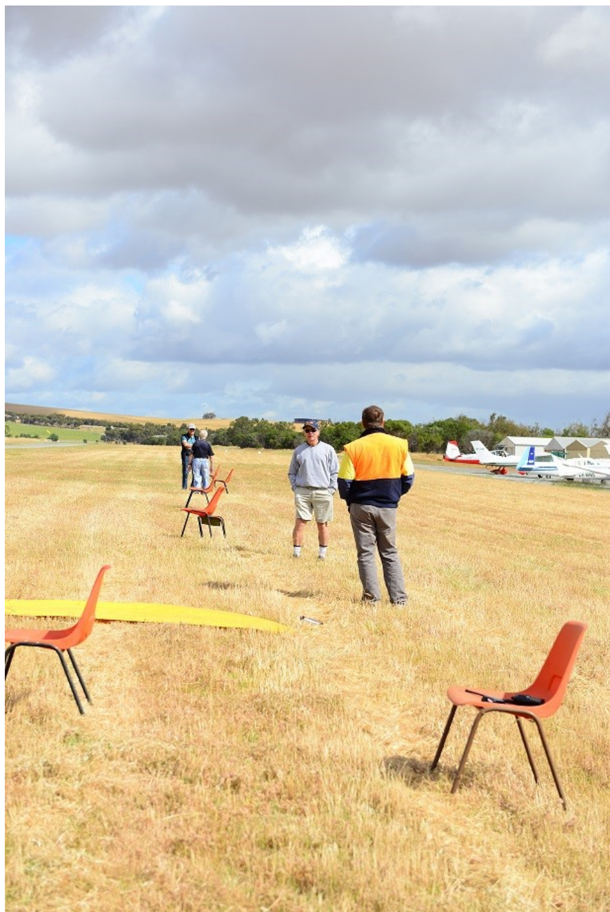
Our Judges hard at work!