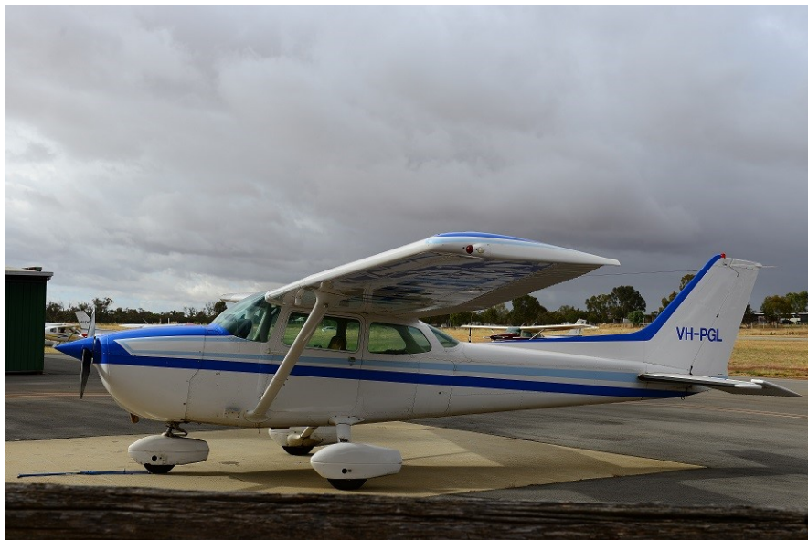
VH-PGL, Looking Great!