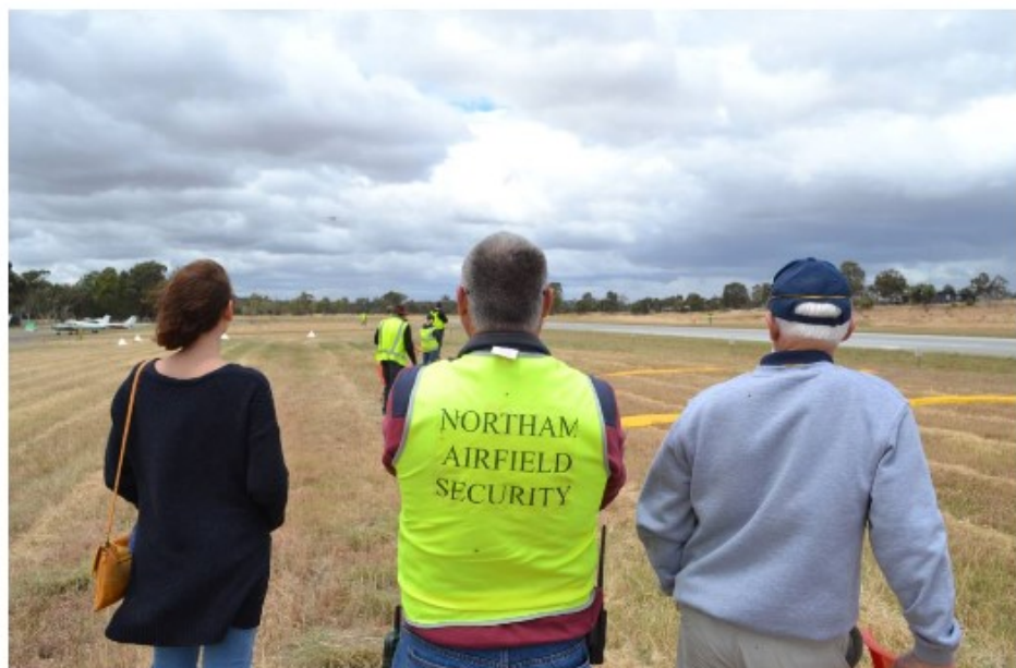
Spectators and judges watching the light aircraft landings at the WA Aircraft Championships at the Northam Aero Club.