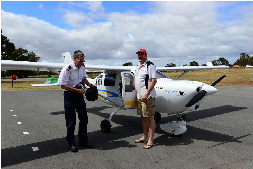
A Competing Jabiru