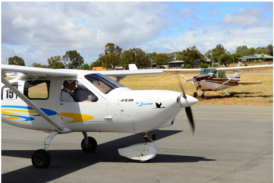
The Jabiru taxis for takeoff