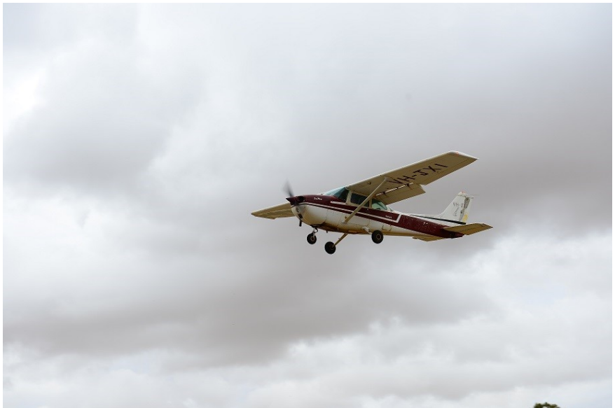
VH-JXI on approach