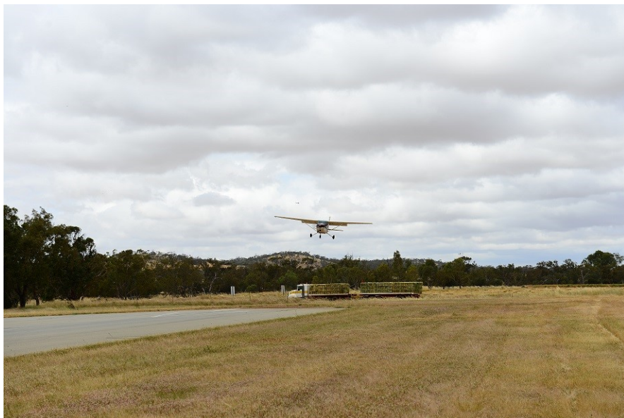
Life doesn't stop on the farm;; note the load of hay in the background.