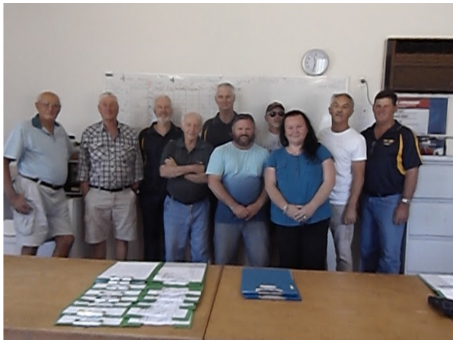
"Sunday 8th November Comp de-rief in NAC Flight Office...