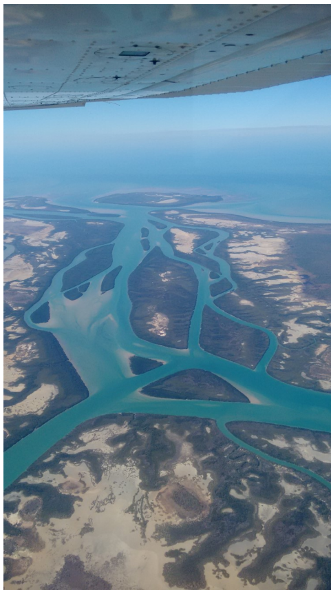
Above: Approaching the coast from the NE of Jabiru.

Hi All, I had the fortunate opportunity to be on a ferry flight for a Cesena 206 from Elcho island NT to Darwin with a stopover at Jabiru for a quick “splash and dash” (fuel stop). Below are some of the happy snaps I took with my phone camera enroute.