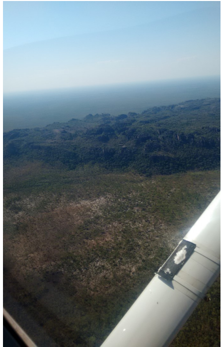
The view from downwind on rwy 09 at Jabiru NT