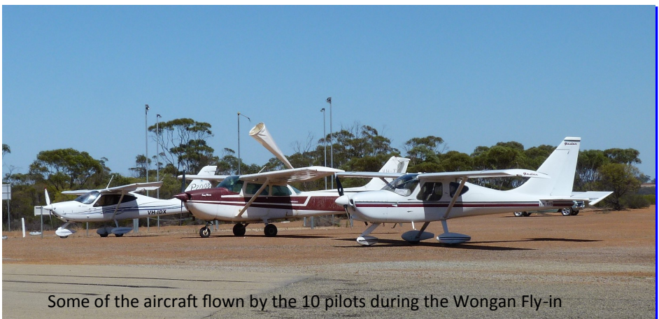
Some of the aircraft flown by the 10 pilots during the Wongan Fly-in