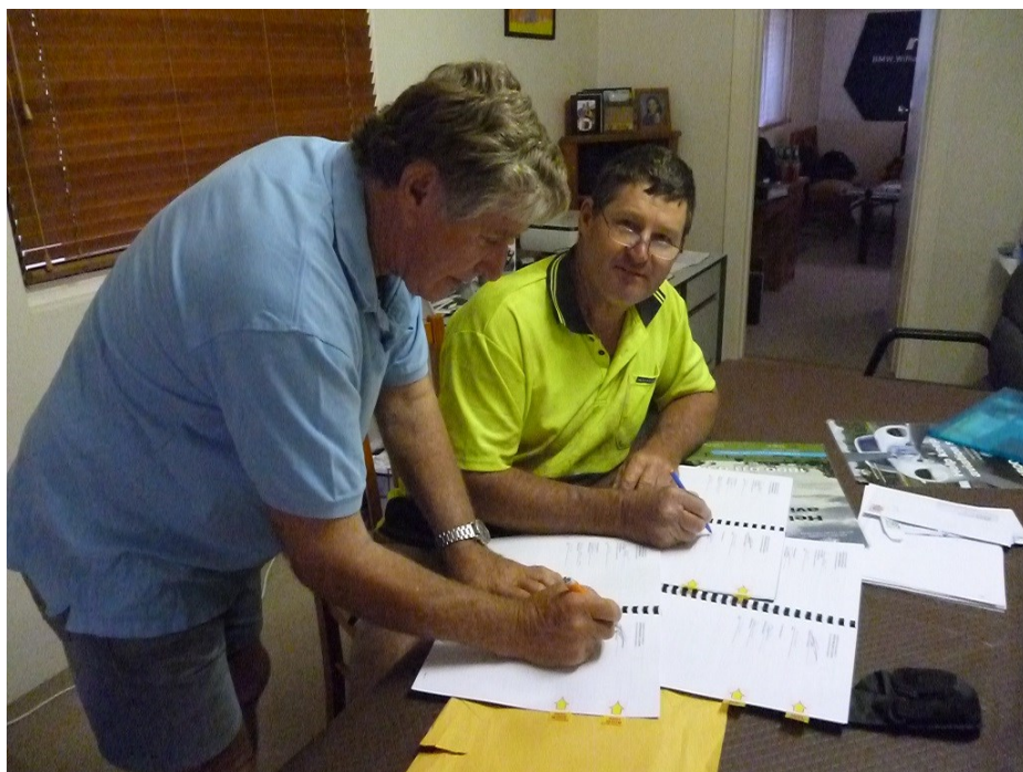
Signing of the Sponsorship Agreement between the Northam Aero Club and the Western Australian Tourism Commission