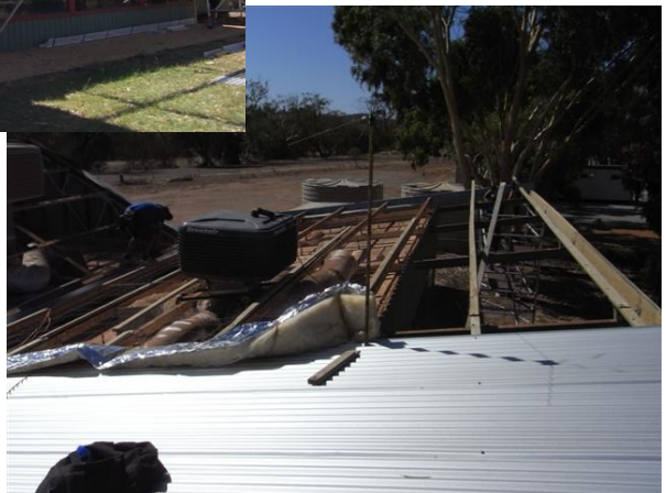
The roof half done