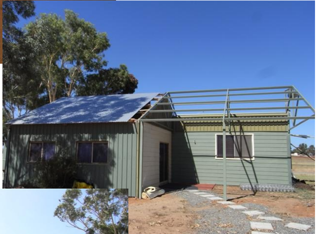
The new roof frame