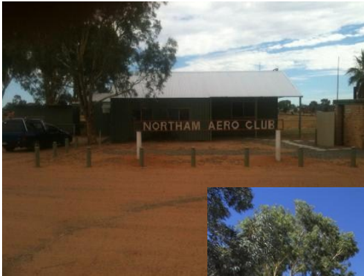
The Club house with the new roof and relocated NAC sign