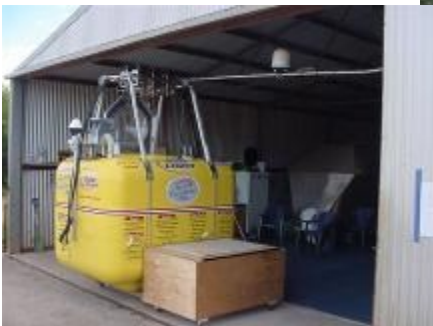
The capsule from Steve's second and successful attempt