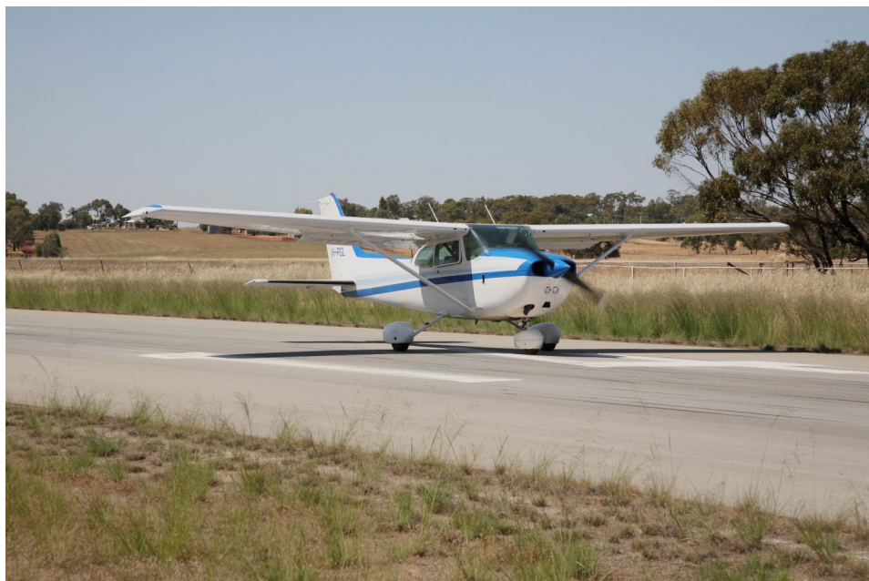
Papa Gulf Lima in Competition Mode Sunday 14th June.