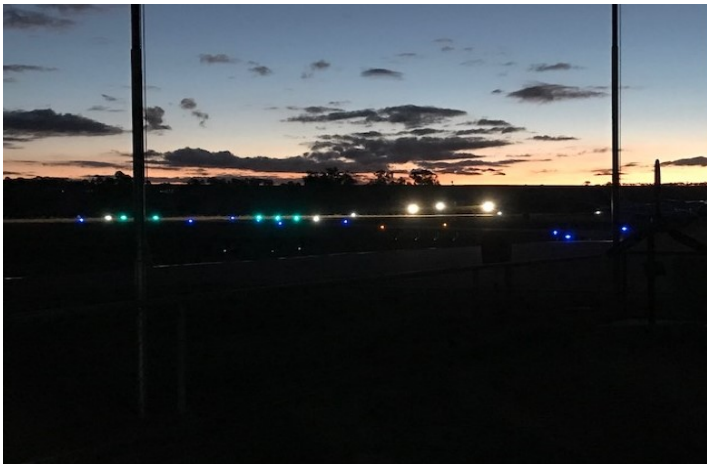
The runway lights in action at Northam Airfield