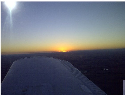
Sunrise over the Great Dividing Range shortly after take-off from Benalla, Vic.

The swing lasts for 10 days and then I do it all over again in reverse for 4 days R&R. The weather is somewhat unpredictable at this time of year with Isolated Thunderstorms very quickly becoming Frequent Thunderstorms, forming impenetrable walls in my path.