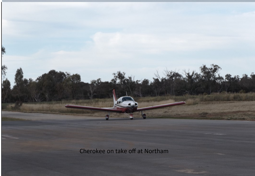
Cherokee on take off at Northam