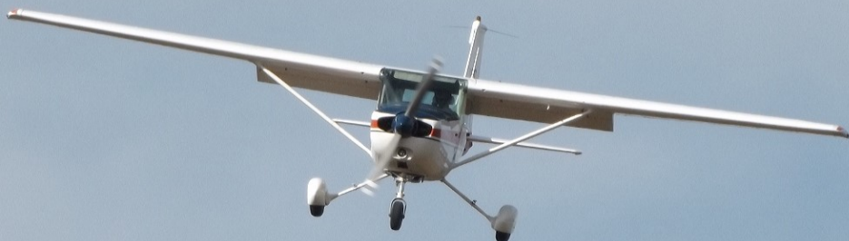
Cessna 152 on late final at Northam