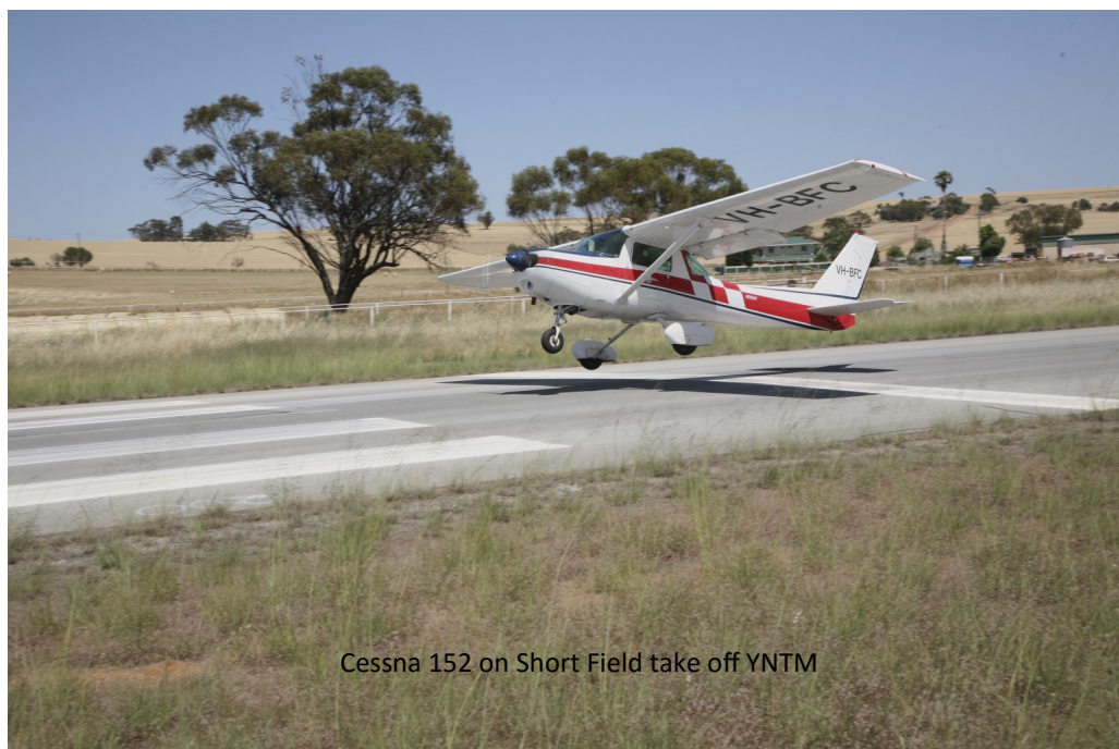
Cessna 152 on Short Field take off YNTM