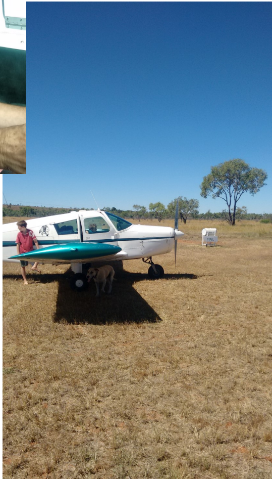
RTL on the runway at Elkedra Station.

Note the letter box adja- cent to the runway for the once weekly mail plane.