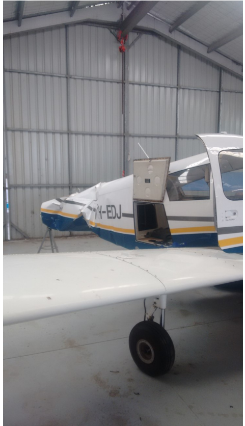
The “Wing Donor” aircraft VH_EDJ A late model PA28