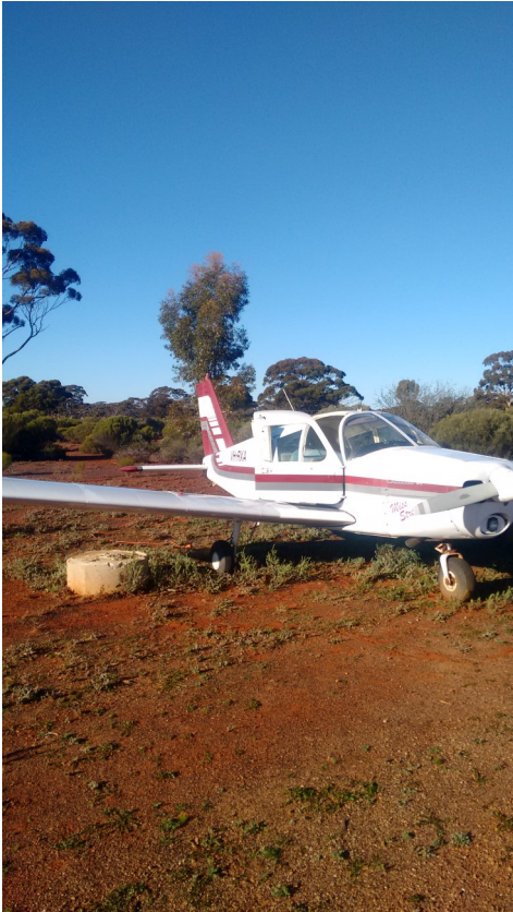
VH-RXA (Roxanne) just after purchase and prior to being broken down for transport.

She needs to do some flying and first trip on the list is Benalla (YBLA) to Darwin (YPDN).