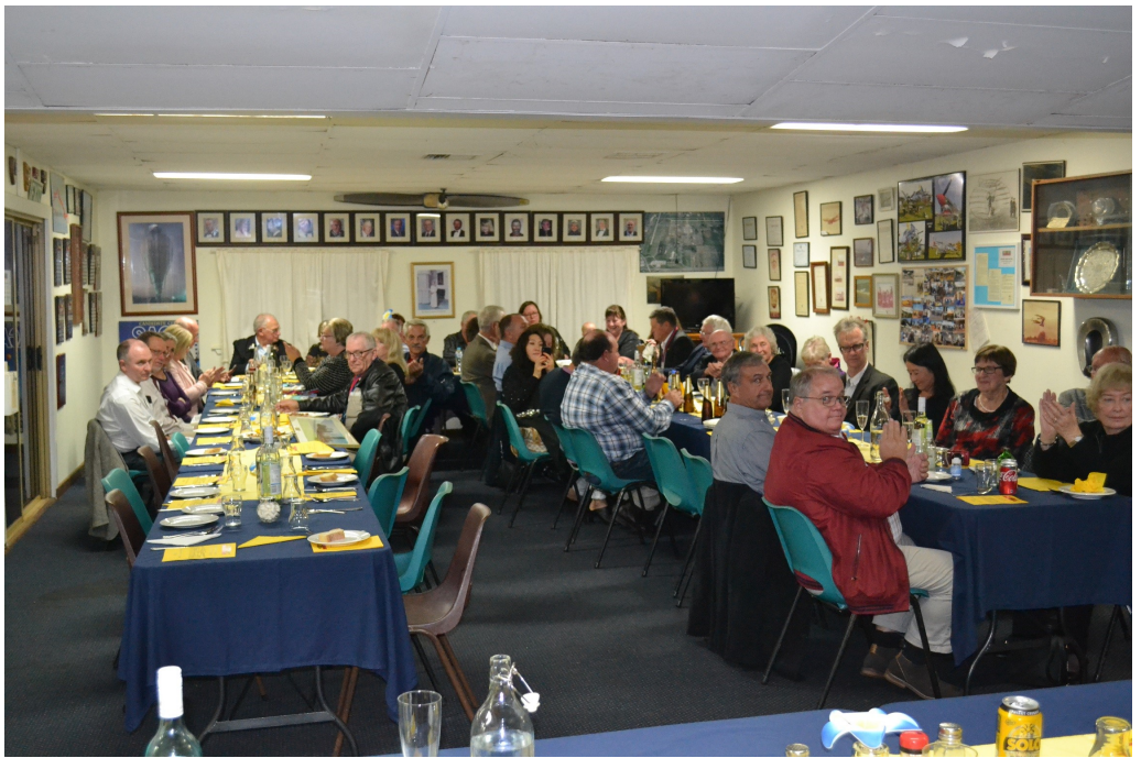
Above: Another great Annual Dinner enjoyed by all!