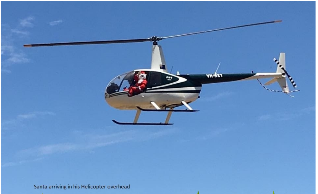
Santa arriving in his Helicopter overhead