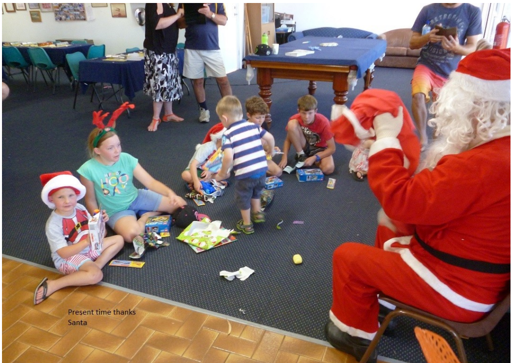
Present time thanks Santa