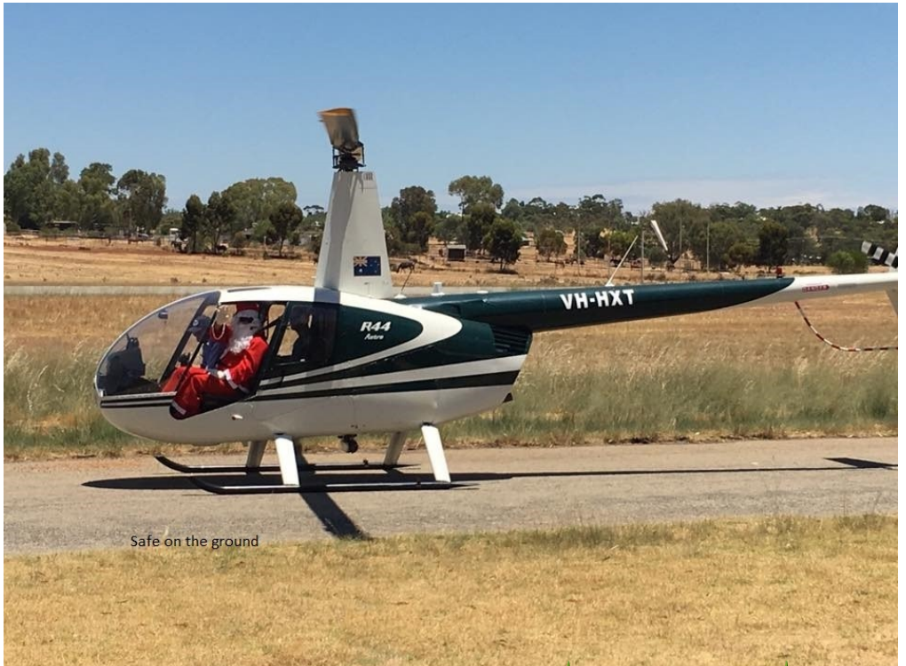
Safe on the ground