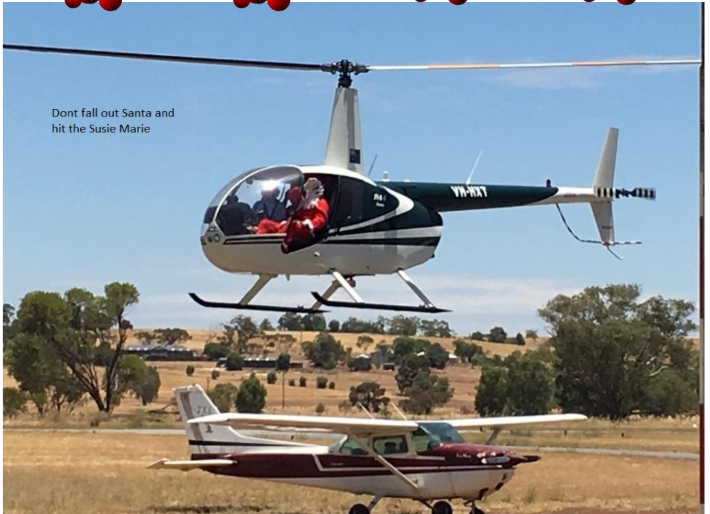
Dont fall out Santa and hit the Susie Marie